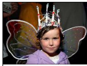
The tooth fairy makes her appearance at the 2007 Only Fools Run at Midnight (OFRAM) in Juneau