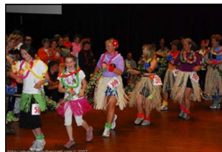
The Hawaiian Hotties show their skills during costume judging at the 2007 Fools Run. For more 2007 OFRAM pictures, see www.sailinc.org