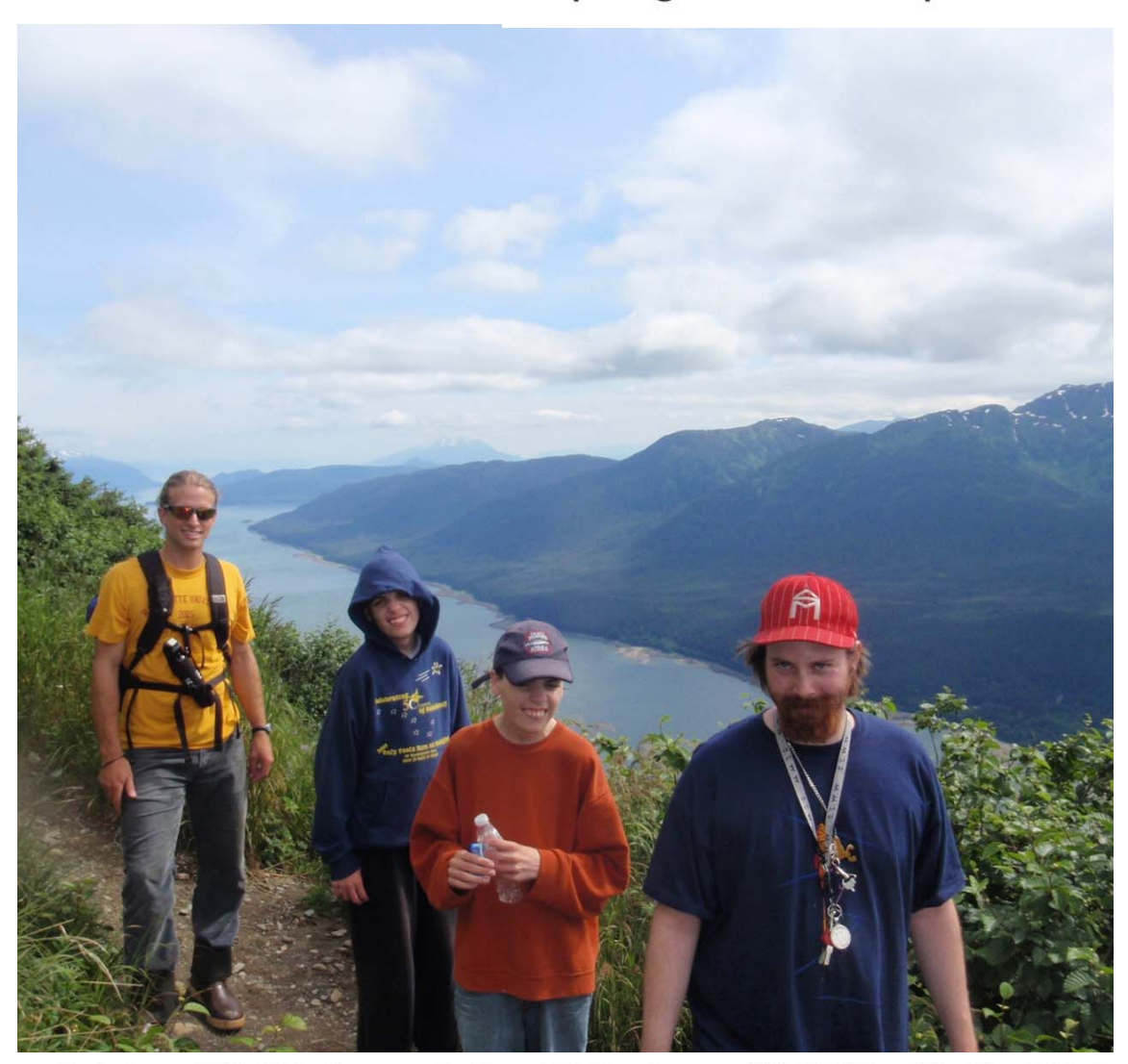
An Aging and Disability Resource Center and Partner Agency of United Way of Southeast Alaska

Information and Referral · Advocacy · Peer Support · Independent Living Skills Training De-Institutionaliation · Outdoor Recreation and Community Access (ORCA)